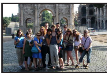
Eugene IHS students visit Rome

Established in 1984, Eugene International High School (Eugene IHS) is an award-winning alternative school in international studies for students in grades nine through twelve. The school is designed for students who value global understanding and communication, cultural differences, and improving the human condition. Eugene IHS offers a four-year interdisciplinary humanities curriculum focused on the study of nations, their cultures, history, artistic expression, and political, economic, and belief systems. Students who graduate from Eugene IHS will have developed a cultural awareness necessary for international communication and understanding.