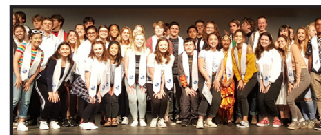
International Baccalaureate Diploma candidates are honored with IB stoles at the end of senior year

Eugene IHS is a member of the International Baccalaureate Program, a world-wide affiliation of schools that promotes international standards of achievement. All coursework for Eugene IHS juniors and seniors meets the requirements for the IB program. Eugene IHS students may choose to pursue the full IB Diploma with examinations in six subjects or test as course candidates in individual subjects. IB tests can earn students college credit in universities and colleges all over the world. For more information on the IB Diploma program go to the International Baccalaureate Organization's website at: www.ibo.org .