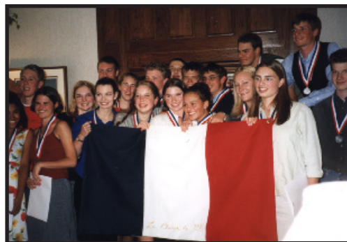
Eugene IHS offers French and Spanish immersion programs