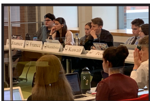
Eugene IHS students attend the Model United Nations conference